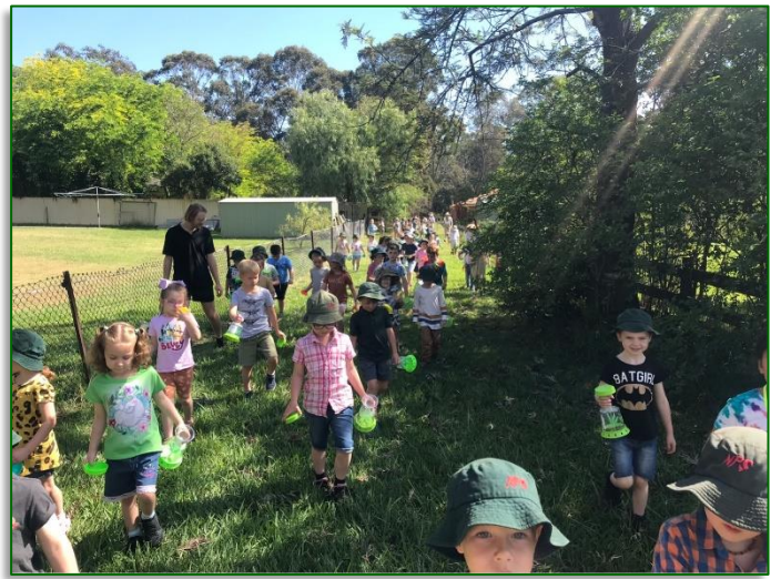
As you can see by their smiles, Kindergarten were super excited to participate in their first ever athletics carnival this term and also out incredible school production.