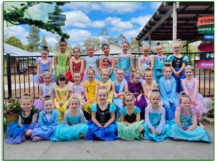
Kindergarten have loved the anticipation each week to see who will be selected from each class to be out 'Weekly Wonder Kids. Here is a photo of the most recent winners.