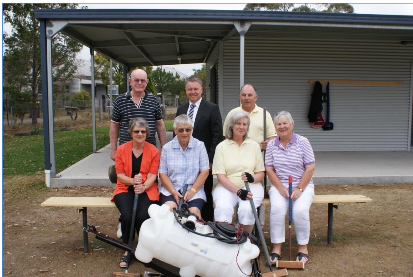
(Branxton Croquet Club received $1814.00 in the 2012 Volunteer Grants.)

Applications for Volunteer Grants 2015 close at 2pm AEDT on Wednesday, 9 December 2015.